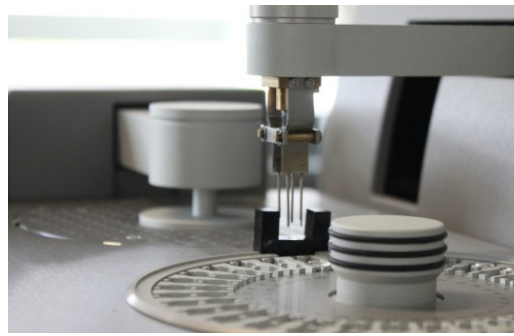
Standardization of fiber volume content (FVG) determination using thermogravimetric analysis (TGA).