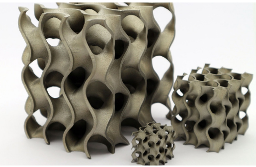
Laser-based Powder Bed Fusion of Metals (PBF-LB/M): Gyroid structure with stainless steel alloy